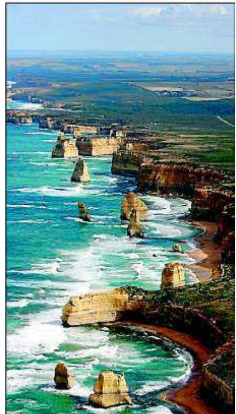
Idyllic ... left, Hayman Island; the Twelve Apostles on the Great Ocean Road.