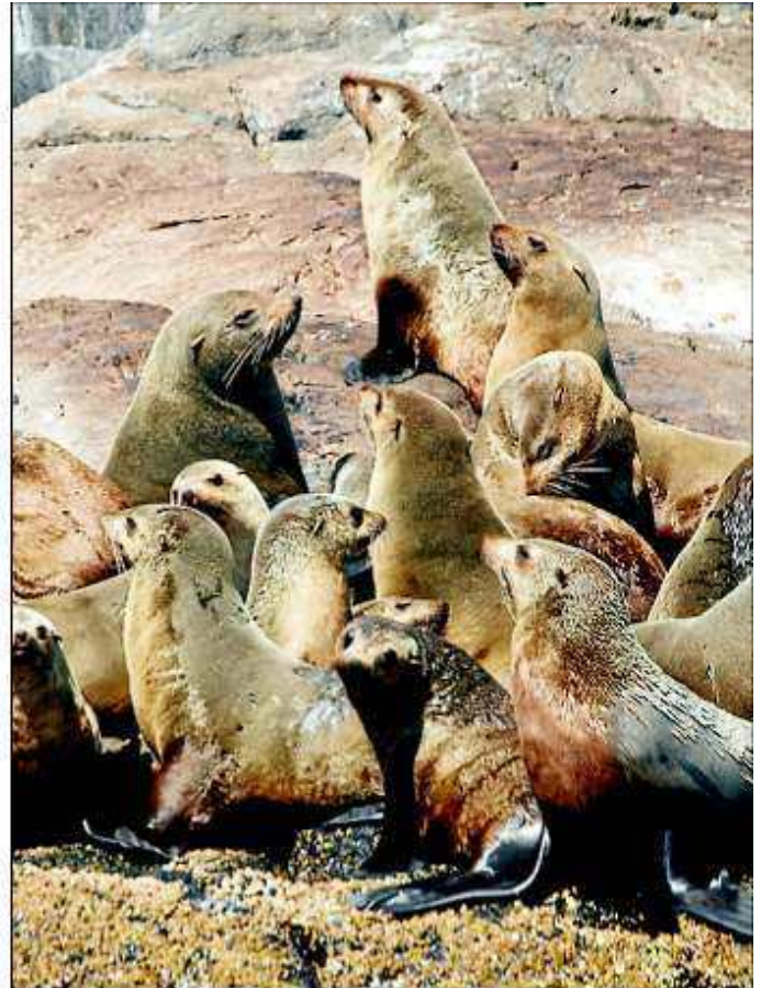
Cool choices ... clockwise from above, Royal National Park; Montague Island; Thirlmere; Dreamworld.